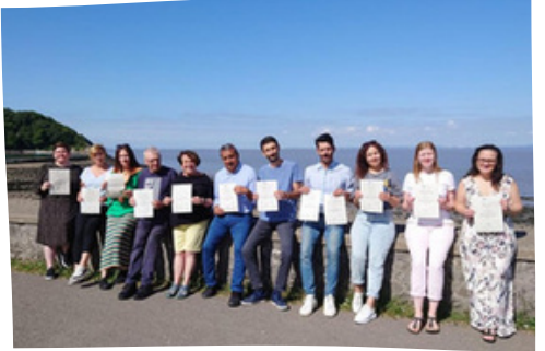
Training event in the UK