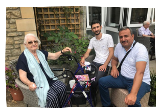
Visit at Winash Residential Care Home