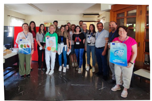
Transnational Meeting in Greece

Alzheimer's disease: https://www.ensoacademy.com/_files/ugd/6b46fd_85a7047485a94698ae97c29c1169fb72.pdf